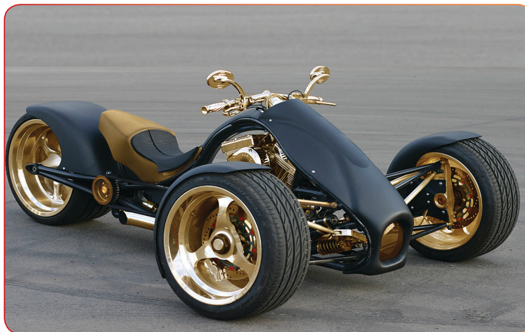
Steam Punk Cycle