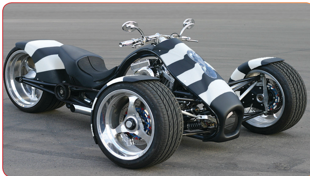
Bad Boy Cycle