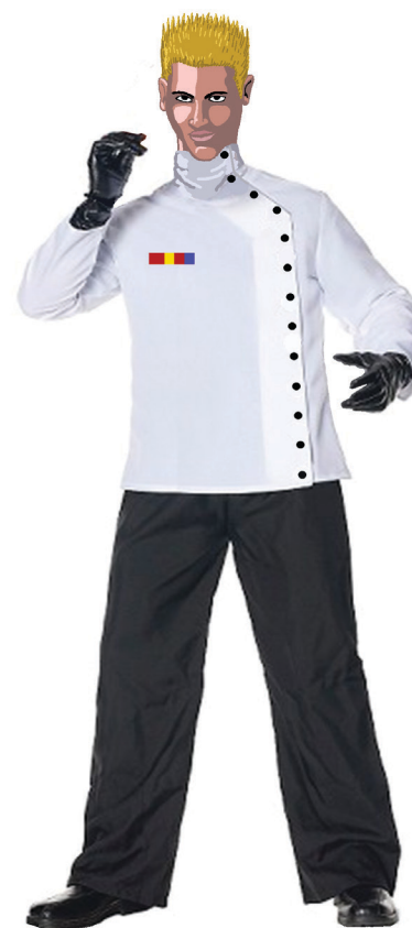
Professor - Villain